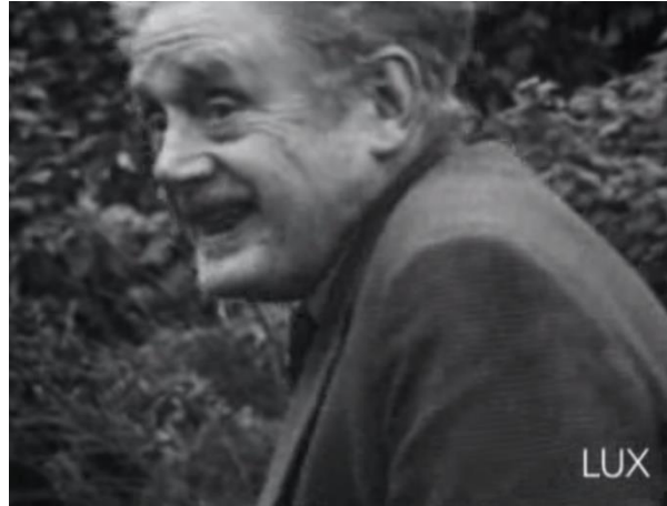
MacDiarmid playing in a burn, still from Hugh MacDiarmid (Tait, 1964)